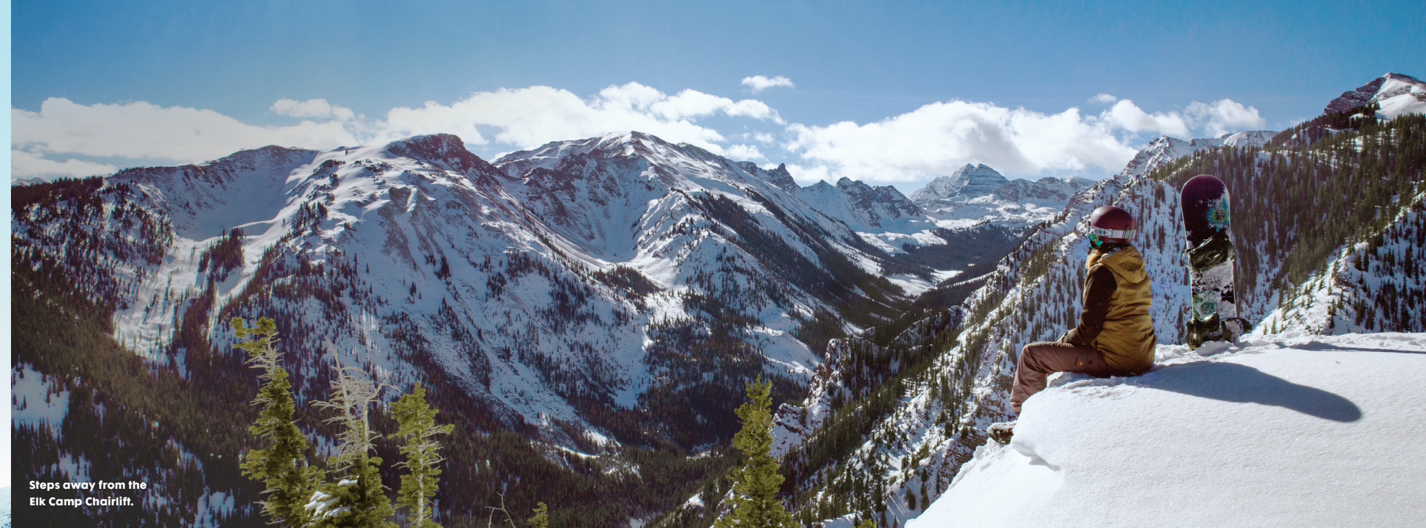
Steps away from the Elk Camp Chairlift.

Meet your outside side at GoSnowmass.com