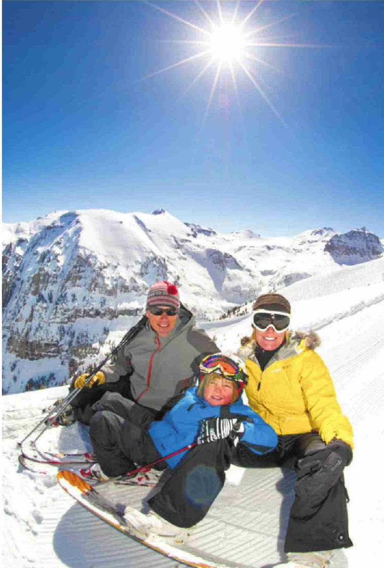
Telluride Colorado Ski Resort

Telluride Colorado Ski Resort is a great destination for a family ski trip.