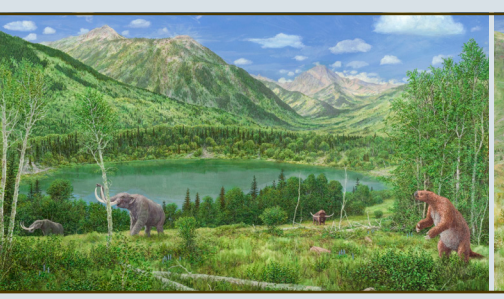
About 120,000 years ago, when the area was dominated by mastodon, giant ground sloths, and bison.

Acrylic paintings of Ziegler Reservoir landscape by Jan Vriesen.