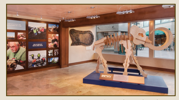
Snowmass Ice Age Discovery Center located on the Snowmass Mall.

Touch mammoth and mastodon teeth. Wonder at a half-sized six foot wooden mammoth skeleton. Read Ice Age books in the children's library. See video from Denver Museum of Nature & Science and learn the story of the Snowmass Ice Age discovery through creative displays, educational panels and interactive programming. The Snowmass Ice Age Discovery Center on the Snowmass Mall is built for kids with plenty of things for adults to enjoy too. Open daily from 10:00am-5:00pm. June 1 to October 1 and December 1 to April 15. FREE! For more information, call 970.922.2277 or visit www.gosnowmass.com.