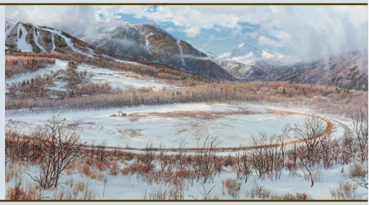
Depicts November 15, 2010, as the first phase of fossil excavation was concluding.