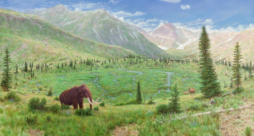
Depicts 70,000 to 60,000 years ago, when the area was dominated by mammoth, camels, and deer.