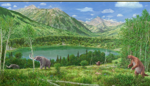
About 120,000 years ago, when the area was dominated by mastodon, giant ground sloths, and bison.