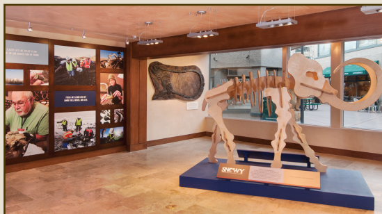
Snowmass Ice Age Discovery Center located on the Snowmass Mall.

Touch mammoth and mastodon teeth. Wonder at a half-sized six foot wooden mammoth skeleton. Read Ice Age books in the children's library. See video from Denver Museum of Nature & Science and learn the story of the Snowmass Ice Age discovery through creative displays, educational panels and interactive programming. The Snowmass Ice Age Discovery Center on the Snowmass Mall is built for kids with plenty of things for adults to enjoy too. Open daily from 10:00am-5:00pm. June 1 to October 1 and December 1 to April 15. FREE! For more information, call 970.922.2277 or visit www.gosnowmass.com .