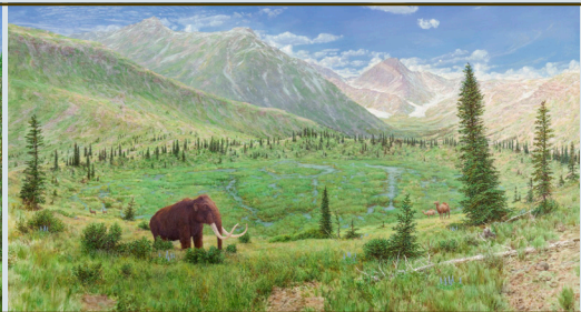
Depicts 70,000 to 60,000 years ago, when the area was dominated by mammoth, camels, and deer.