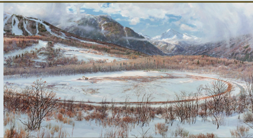
Depicts November 15, 2010, as the first phase of fossil excavation was concluding.